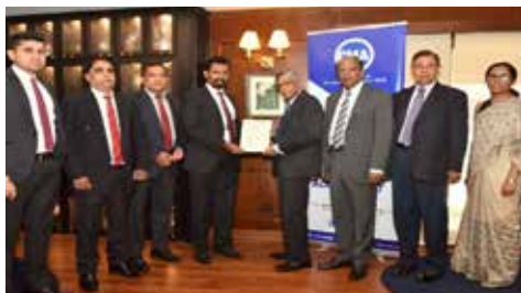
Hunters & Co. PLC