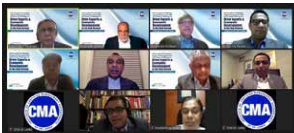
Export Performance 2021 and Future Challenges to Drive Exports & Economic Development in the New Normal – 3 rd February 2022