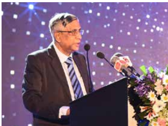
President CMA Sri Lanka

The "CMA Excellence in Integrated Reporting Awards 2021" was held for the 7th consecutive year to recognize and honor Sri Lankan companies preparing high quality integrated reports. With the challenges put forward by the Covid 19 pandemic, the awards ceremony was held as a hybrid event combining virtual and physical presence on 11th January 2022 at Taj Samudra, Colombo.