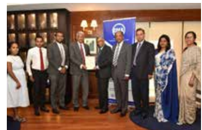
Tudor V. Perera & Company