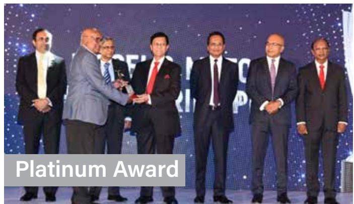
(Award for exhibiting excellence in Integrated Reporting consistently over a period of seven years). Diesel & Motor Engineering PLC