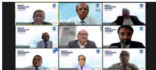
Impact of Foreign Exchange Fluctuations on Costing & Pricing of Products and Services – 18 th March 2022