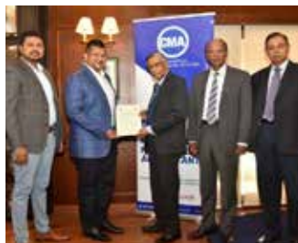
Generation Next Trading (PVT) Ltd