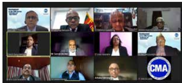
Development of the SME Sector - Challenges and Opportunities - 21 st February 2022 Organized by CMA Sri Lanka COVID - 19 SME Development Committee Meeting