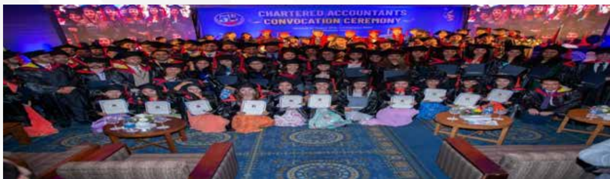
Group Photo of the participants of 5th Chartered Accountants' Convocation Ceremony