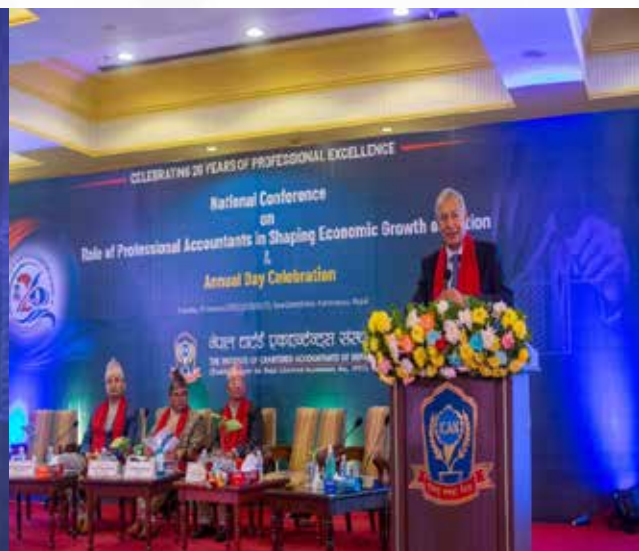
Dr. Yuba Raj Khatiwada, Former Minister of Finance delivering Keynote Speech