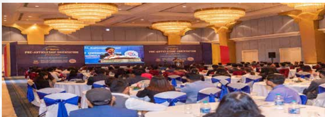
Glimpse of Pre- Articleship Orientation Training

The Institute organized Pre-Articleship Orientation Program for the students who have passed CAP II level examination of December 2022 on 23 rd February 2023 at Hotel Yak and Yeti, Durbarmarg, Kathmandu, Nepal. The purpose of this orientation program was to enhance the skills and capabilities of students going to pursue three years articleship training by providing proper orientation and training on personality development, communication skills, professional behavior and culture at audit firms and clients' offices. The program was broadcasted live in branch offices of ICAN for the students residing outside of Kathmandu Valley.