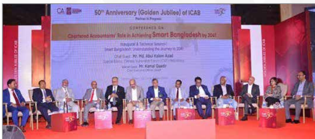
Technical Session I: Chief Guest, Special Guest and Resource persons