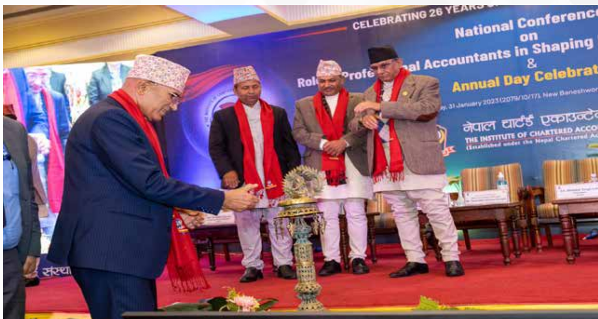
Hon'ble Deputy Prime Minister and Finance Minister, Mr. Bishnu Prasad Paudel inaugurating the program.

The program was inaugurated by Chief Guest of the program by lightening the lamp. The Chief Guest delivered his speech congratulating the Institute for celebrating its 26 th year of establishment and elaborated the role of Institute for economic development of Nation.